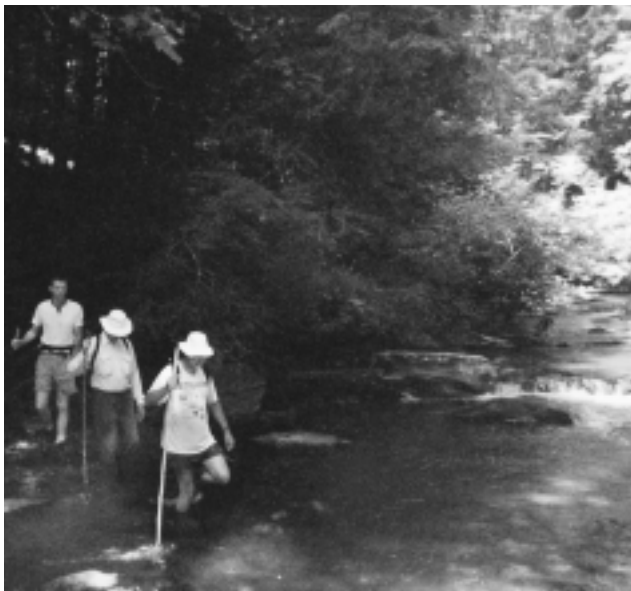
Riverkeeper members ford the Chattahoochee at its headwaters above Helen on a recent River Adventure. Members and staff spent a challenging but rewarding day exploring this rugged reach of the Chattahoochee River.

Ⓒ If you observe dead fish, report the incident as soon as possible by following the procedures outlined below.