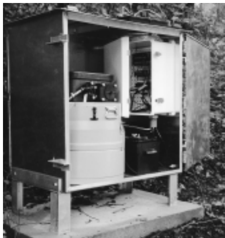
Riverkeeper's first real-time monitoring station