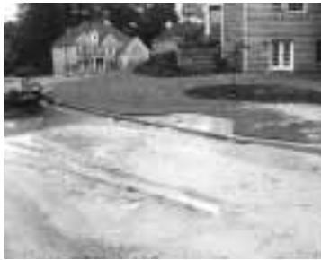
Sediment-laden water enters a storm drain en route to a nearby stream.

A year ago this month, a federal permit controlling stormwater runoff from large construction sites became effective in Georgia—after eight years of litigation between environmental groups and developers. This means that developers must comply with