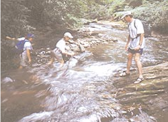
Fording a rapid on the river in the Chattahoochee National Forest during the July Headwaters Hike.