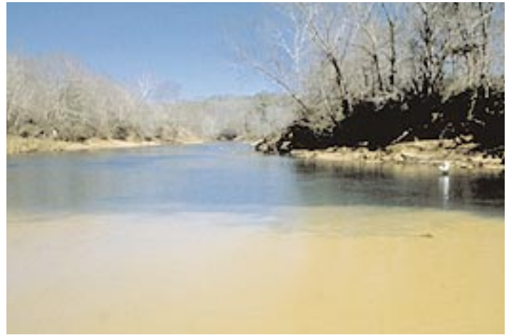
Eroded soil flows out of Dick's Creek into the Chattahoochee.

The fact is that our rivers are not naturally muddy. A "red" river is a sign of an ecosystem under stress from eroded soil. Each year, thousands of tons of mud and silt are discharged