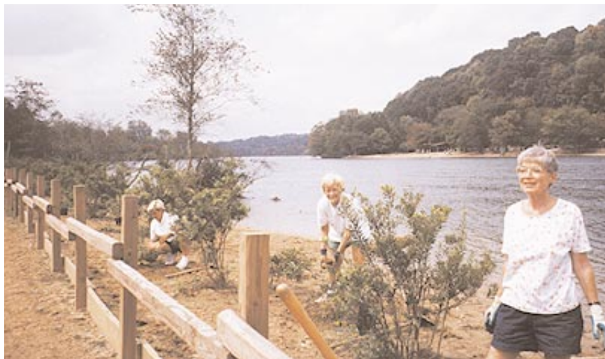
Eight dump trucks full of horse manure were removed from the riverbank and trees and bushes were planted to stabilize the soil and create a buffer zone.