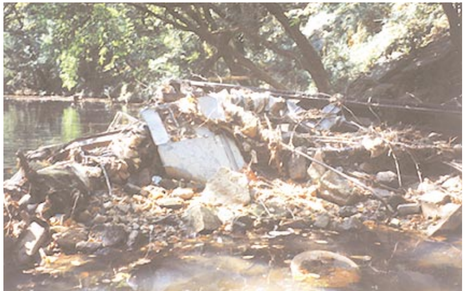
All trash and debris will be removed from 37 miles of urban streams.

The Atlanta streams that will benefit from the cleanup are Proctor Creek, Utoy Creek, Intrenchment Creek, McDaniel Branch, Clear Creek, Tanyard Creek and a portion of the South River . If funds are available, a portion of Peachtree Creek will also be cleaned. Professional crews will remove trash, household appliances, automobile engines and parts, shopping